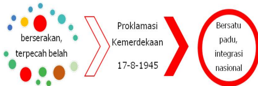
Figure 1: Proclamation of Indonesian Independence is a process of integration of the Indonesian Nation (Team, 2016: 69)